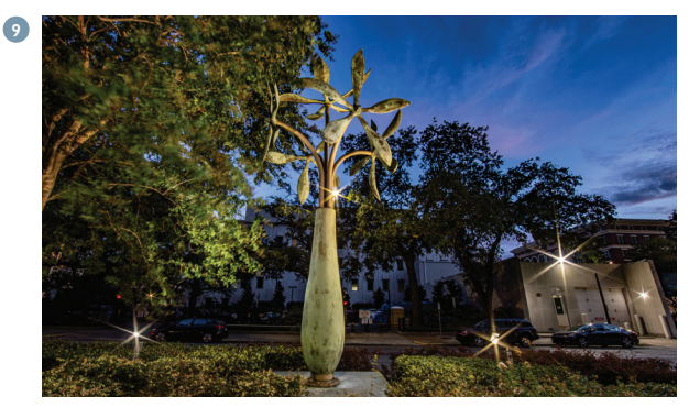
James Surls Standing Vase With Five Flowers The Helis Foundation Collection