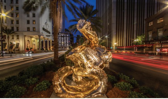
Lynda Benglis Power Tower The Helis Foundation Collection