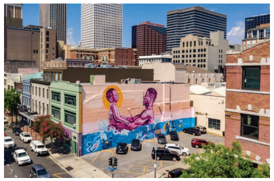
Brandan "B-Mike" Odums in partnership with Young Artist Movement

OPEN HOUSE is a mural and an invitation. The mural depicts a life-size section through a late 19th century New Orleans home. Illustrated in black linework on a white background, the mural reveals a domestic interior rarely exposed in totality. Like an open house, it transforms the private home into a public space. OPEN HOUSE also invites visitors to become temporary inhabitants. The floor of the house is drawn level with the sidewalk, creating a two-dimensional stage set replete with domestic props. Walk through passively or act out — jump on the bed, shower with your clothes on, hold court around the fireplace mantel. Either way, make yourself at home.