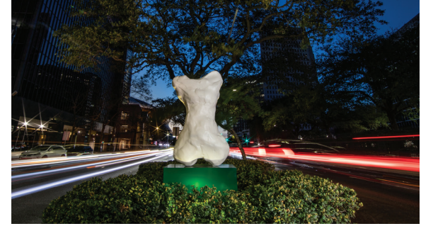
Anastasia Pelias ViVa (& the whole garden will bow) On loan courtesy of the artist & Ferrara Showman Gallery

As the South's largest rotating public sculpture exhibition, with fourteen installations currently on view, Poydras Corridor Sculpture Exhibition presented by The Helis Foundation reinforces New Orleans' status as a leading international destination for the visual arts; creates economic and programming opportunities for a diversity of artists; and beautifies and provides visual interest to the heavilytrafficked vehicular and pedestrian artery connecting the Arts District, Central Business District, and historic French Quarter.