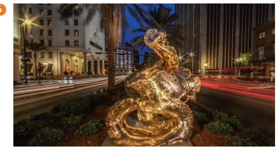
The Poydras Corridor Sculpture Exhibition presented by The Helis Foundation TheHelisFoundation.org

Celebrating the diversity and excellence of the Art of the American South. Featuring dynamic exhibitions of Southern painting, photography, sculpture and much more.