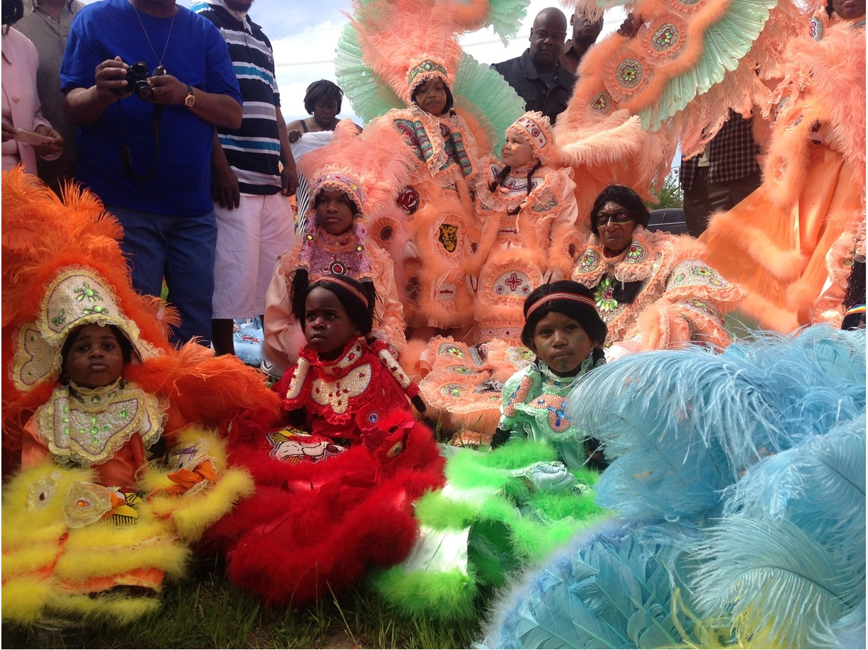
Photo of Creole Wild West